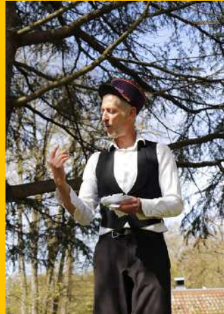
Reading the messages of the inspired and excited participants