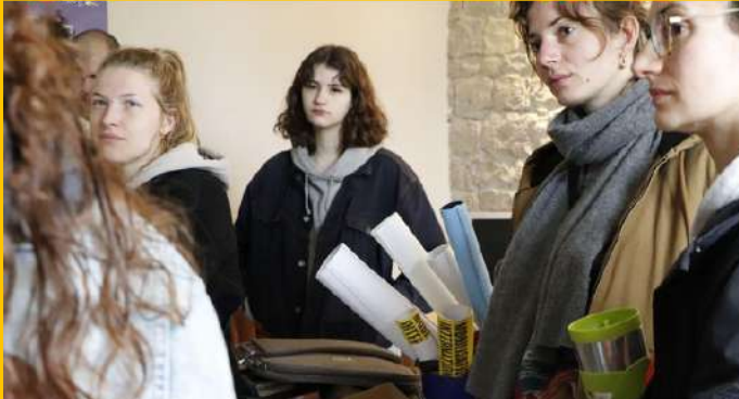
Visiting the delegation of Beaumotte