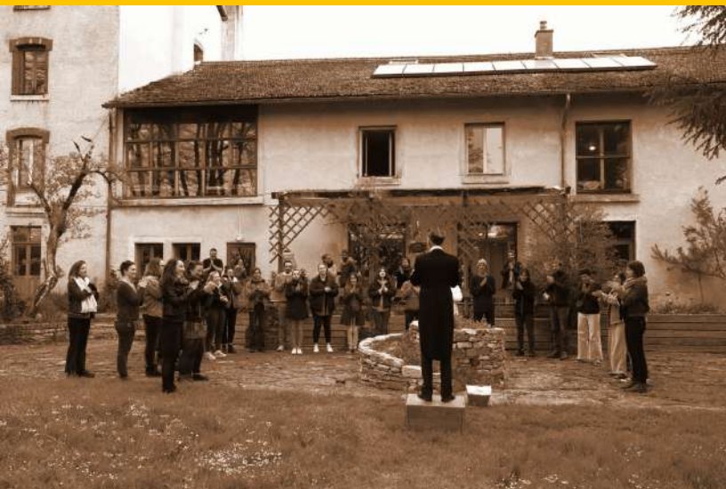
CENTRE DE BEAUMOTTE