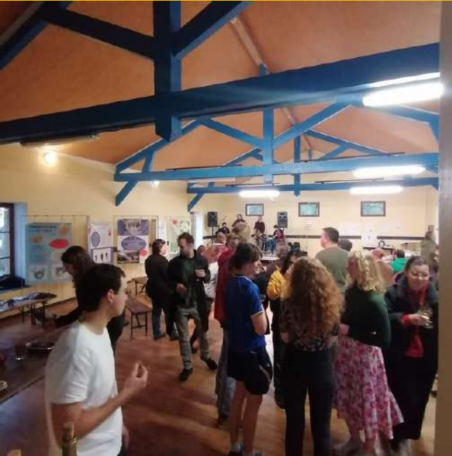
The musiciens explained us some traditional dance-steps.