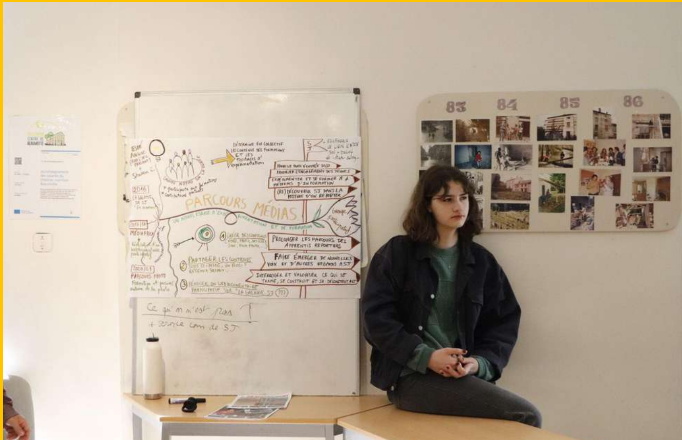
Introduction of the brand new experimental project by Sŷ