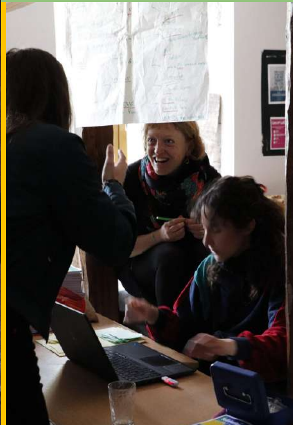
Mandates committee about to start working