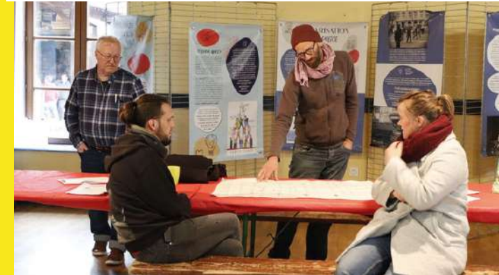
Workshop about sense of work