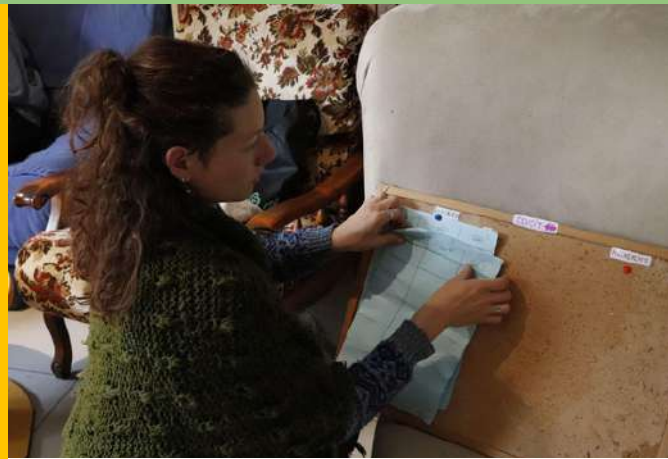
Organisation and logistique