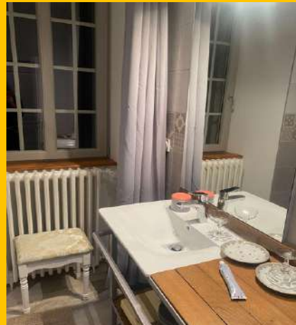
Rooms at << Gîte Château >>