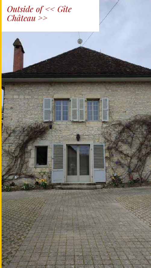
Outside of << Gîte Château >>