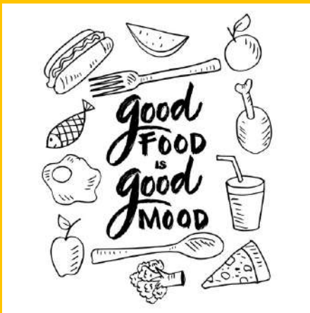
Workshop about cooking had taken place at the same time. We had chance to degustate yummy food made with love