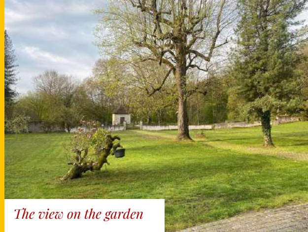
The view on the garden