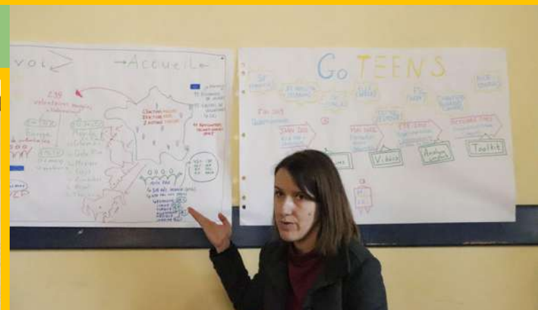
Go with Teenagers and Empowerment through Networking aims at supporting the quality development and evaluate international projects for teenagers