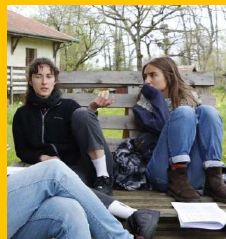
Outdoor discussion about budget, sources and resources :)