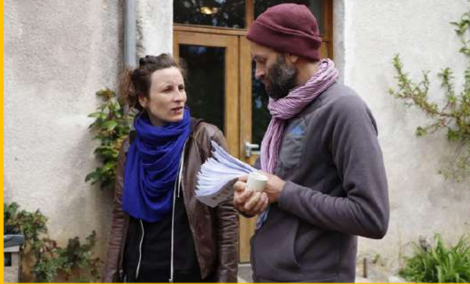
Working in pairs