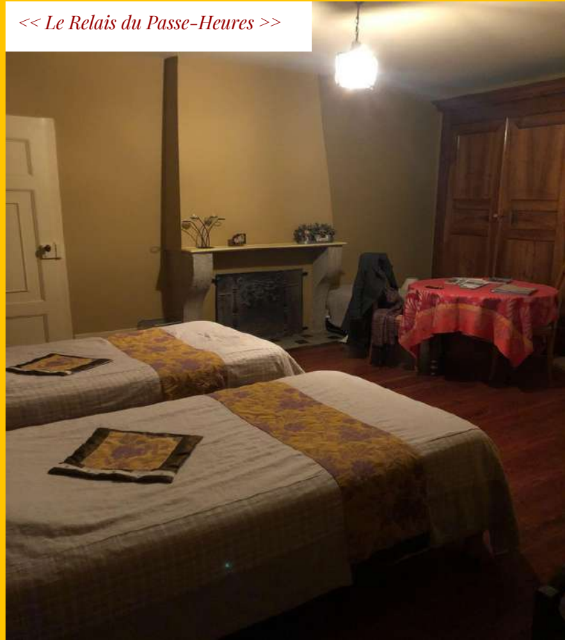
<< Le Relais du Passe-Heures >>