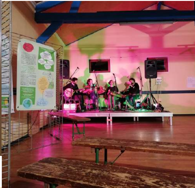
The band <<Balaru>> came from Piemonte to perform local and international folk music.